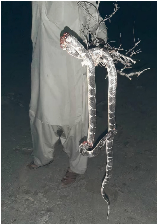
Figure 3) Images of damaged Persian Krait, Bungarus persicus , by local farmers.

pairs all end in pairs of rectangular whitish dots or short crossbars crossbar along the vertebral section. The head is black above and yellowish white below with a sharp border between the colors along the upper edge of the supralabials. The specimen of this study is congruent with the description of Bungarus persicus .