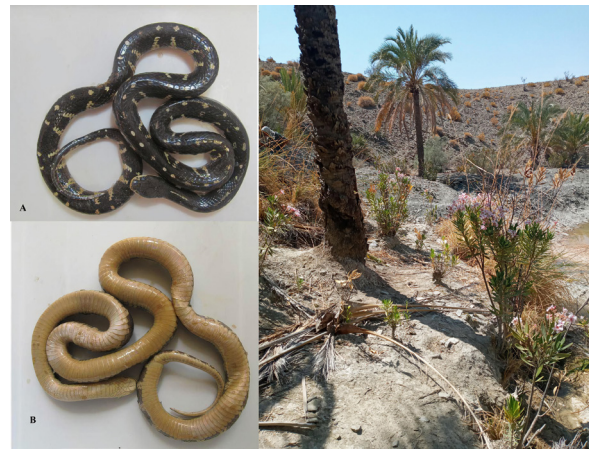
Figure 2) Images of Bungarus persicus . A: in dorsal view. B: in ventral view. Habitat of Bungarus persicus Tidar region, Bashagard, Hormozgan Province in southern Iran (the specimen BVMUMB. 01; right).

infralabials; 17 smooth dorsals at midbody; 227 ventrals; anal plate undivided; 49 subcaudals; Snout-vent length 835 mm; tail length 115 mm, the total length of the body 950 mm (Figure 2). The head is black above and yellowish white below with a sharp border between the colors along the upper edge of the supralabials. The preocular region and postnasal are yellowish-white, whereas the small loreal area is black. The eyes are large and black with a grayish oval pupil. The belly is yellowish in the specimen. These characters are fully consistent with Bungarus persicus [6].