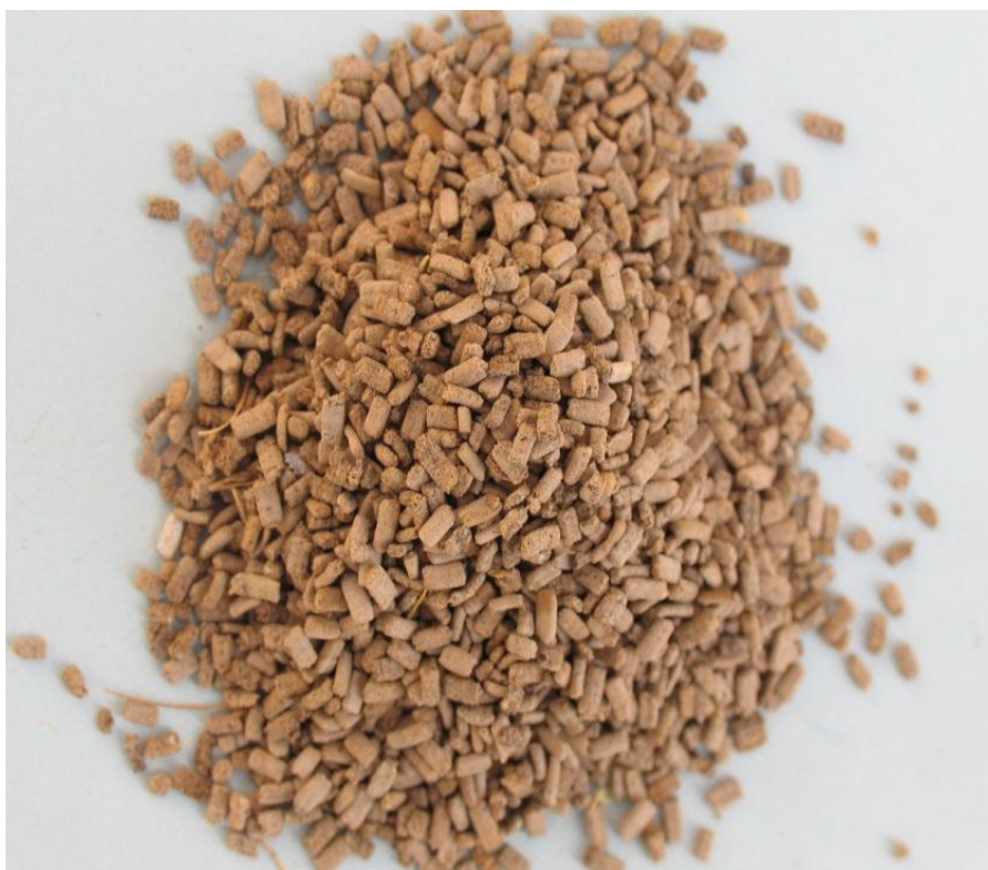
Figure 2 Parallelepiped-shaped burrowed materials of sowbug