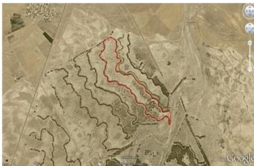
Figure 4 Location of the 2 nd sedimentation basin of Bisheh Zard 1

Where AS is aggregate stability, Wis the weight of oven dried- aggregates and S is the weight of sand particle.