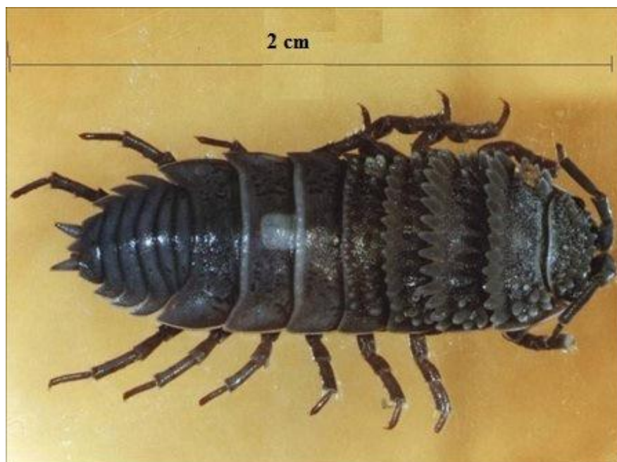
Figure 1 A dorsal view of a female Hemilepistus shirazi Schuttz (Rahbar et al. , 2015)

This viviparous organism lives for about one year. The white brood pouch under the abdomen of the female swells in March. The eggs form larvae in the pouch, and 60-70 sowbugs, very similar to their parents, are released from the pouch in May. They are very active in the spring and fall. They come out of their burrows in the cool air of early morning and late afternoon. It seems that digging deep into the soil is to reach a humid surrounding. There are semi-spherical spaces at the end of their burrows, five to 10 cm in diameter (Rahbar et al. , 2015). They form semi-cylindrical, rods of soil, two mm long and one mm in diameter (burrowed materials), with their mandibles, and place them to one side of the opening of their burrows (Figure 2). These rods are seemingly more resistant to slaking than the freshly laid sediment from which they are formed. As some remains of the sowbug are found in scorpion burrows, it is believed that Hemilepistus shirazi Schuttz is eaten by this arachnid.