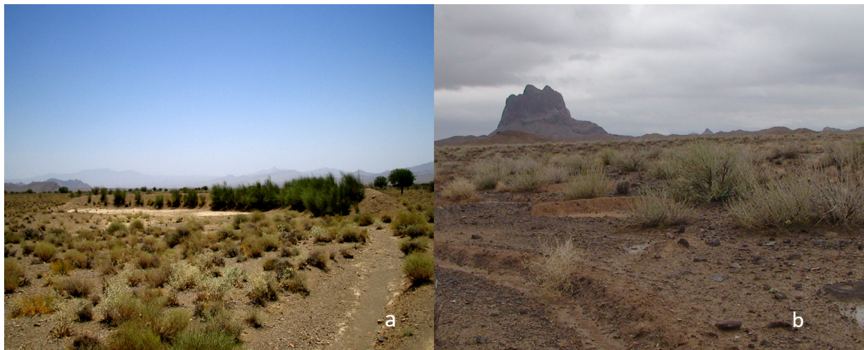
Figure 2) Semi-circular bund area (a) and control area (b).