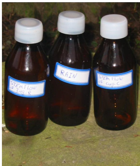
Figure 3 Stemflow and rainfall samples ready to be sent to the lab.

Volume-weighted mean concentrations (VWM, Eq. (2)) of each stemflow and rainfall collector were used to present solute