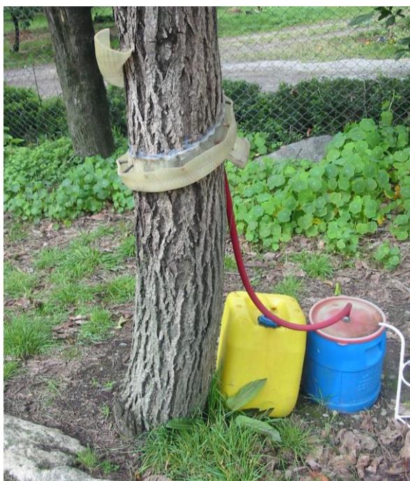
Figure 2 Stemflow collar on Juglans regia Linn.