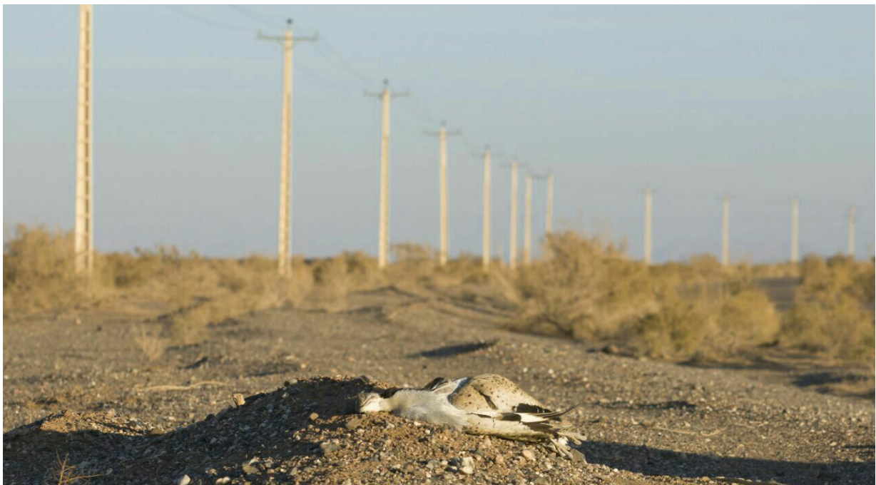
Figure 2) An Asian Houbara found dead after colliding with a power line in the Abbas Abad Wildlife Refuge.

Rangers participated in a one-day field workshop where they were trained in standardized protocols for identifying bird collisions, including recognizing physical signs such as feathers, injuries, or remains near power lines. They were provided with two dedicated contact numbers to report any observed collisions or signs of impact immediately. Rangers conducted bi-weekly inspections of the power lines one year before and one year after installing the anti-collision spirals, documenting any observed bird collisions and focusing on the Asian Houbara. Additionally, local community members and conservationists were informed of the project and encouraged to report any bird collisions they witnessed. Rangers verified any reports from stakeholders through on-site visits to confirm collision evidence. This collaborative approach ensured thorough