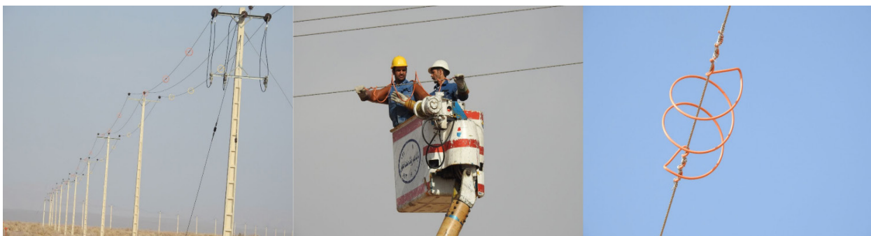
Figure 3) Installation of anti-collision spirals on power lines in the Abbas Abad Wildlife Refuge.