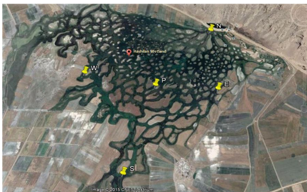
Figure 1 General location of the study area and spatial pattern of sampling stations