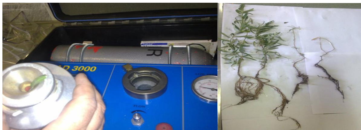
Figure 2 Water potential measuring in seedlings leaf subjected to different treatments (Left) and seedlings after treatment (Right)

Between traits of different watering regime, based on Tukey's HSD (honest significant difference) can be seen from table 1. Means followed by different letters are significantly different ( P < 0.05 ) according to Tukey's multiple range tests.