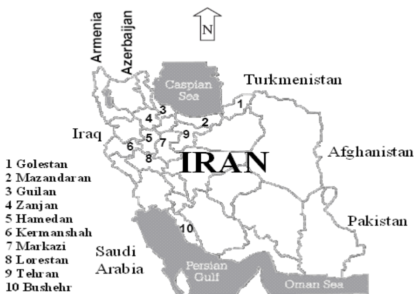
Figure 1 Geographical situation of areas in which the samples were collected.

(Department of the Environment, Iran) that had obtained from illegal hunting of the taxon in Golestan province during 2006-2007.