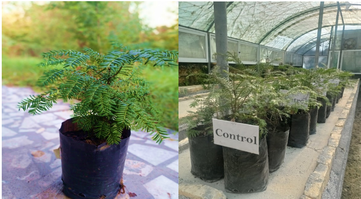
Figure 1 A view of examined common yew seedlings: well-watered seedlings (left) and drought-stressed seedlings (right).

seedlings of a four-year-old common yew ( Taxus baccata L.). It is worth mentioning that, first, the collected seeds of common yew trees were sown in the nursery bed of Nowshahr Ecology Research Station, and in the fourth year, they were replanted in 3 kg plastic pots. The experiment was conducted in a completely randomized design with 144 seedlings in two levels of drought stress (30% and 100% of field capacity (as a control) for six months. Determination of soil field capacity was done according to the weight method [37]. Before applying drought stress, growth traits (shoot height and root collar diameter) were measured, and at the end of the period, these indices were measured again. The amount of shoot growth and root diameter growth was determined by subtracting the measurement of two periods.