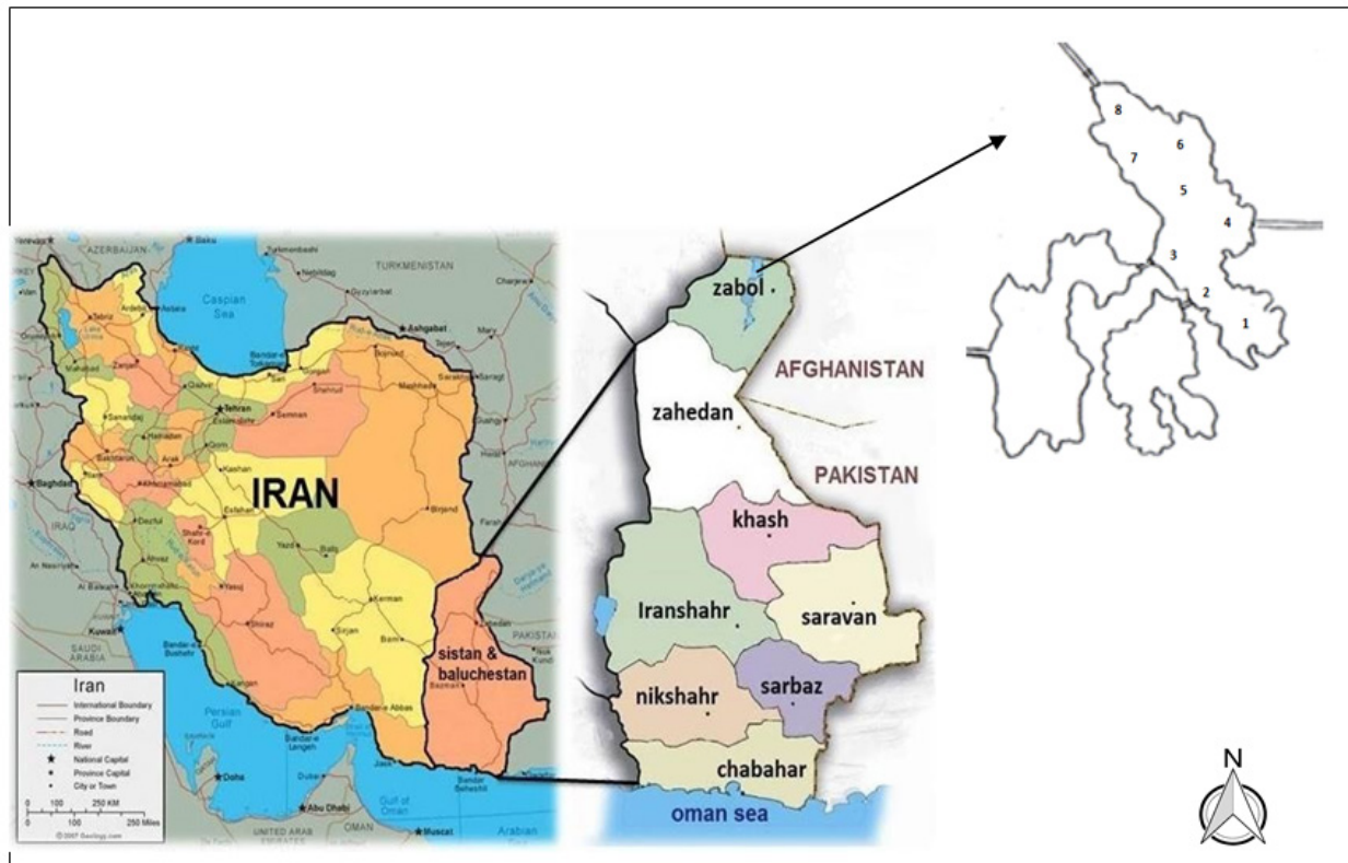
Figure 1) Locations of eight sampling stations along Chahnimeh 1 in Sistan.

were done in the laboratory with the help of international standard methods [6-7]. Then, using multivariate statistical analysis methods such as ANOVA, cluster analysis, Principal Component Analysis, and factor analysis of index factors [8, 9, 10], primary and secondary stations, and sampling frequency, an appropriate plan was designed for monitoring water quality of Reservoir 1 of Chahnimeh reservoirs in Zabol.