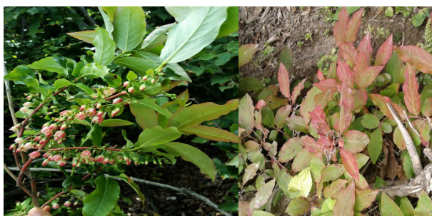
Figure 2) Pictures of V. arctostaphylos in the study area.

medicinal species of V. arctostaphylos (Figure 2) is distributed, and eight habitats were selected based on the diverse topography of the area and the purpose of the study. Because this is rare, finding it in the area was challenging; therefore, the species' location in each habitat was determined first, and then longitude and latitude data and physiographic factors were recorded using GPS. Then, from a depth of 0-30 cm (active rooting depth), 40 soil samples were taken from the presence and absence areas of species [1]. Then, in the University of Mohaghegh Ardabili's soil science laboratory, some physical and chemical properties of soil including pH, EC, texture, lime, soluble potassium, magnesium, saturation percentage of soil (SP%), soluble sodium, organic carbon, absorbable phosphorus, soluble bicarbonate, total neutralizing value (TNV) and the percentage of clay, silt, and sand were measured using physical and chemical analysis methods [19].